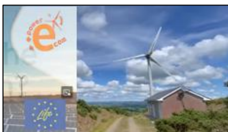
Community Power in Ireland: The Story of a Community-Owned Wind Farm in Templederry