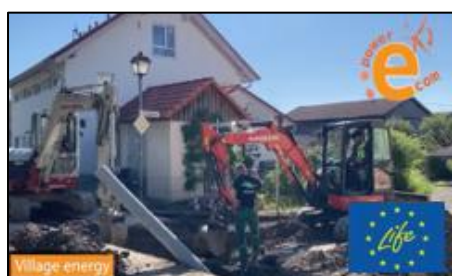
Schwabsoien and Schwabbruck in Bavaria, Germany: On the Way to a Climate-Neutral Community