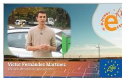
Spotlight on Rivas, Madrid, Spain: Harnessing Solar Power for Energy Independence