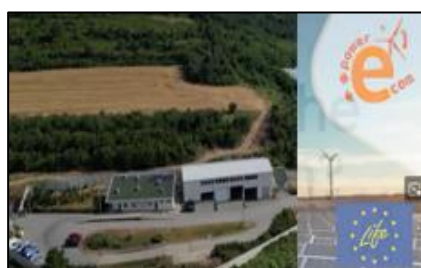
Pilot Region in Gabrovo, Bulgaria: Building Local Energy Communities for a Sustainable Future