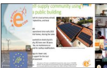
Renewable Energy Communities in Slovenia: Challenges & Success Stories