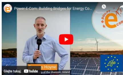
Energy Communities in Ireland - Seamus Hoyne (TUS, Ireland)